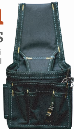
GRANDE Part# 43095