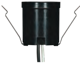
80-2299 9" AWM Leads Snap-In Socket w/Top Rim & for 3 1/4" - 4" Holders B/W Leads 105°C Ht. 1 1/2" Dia. 1 1/4" 660W-250V