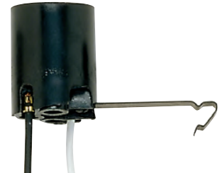
90-542 Snap-In Socket for 8" & 10" Pans Bracket Extends 1 3/8" from End of Socket 8" AWM B/W Leads 105°C Ht. 1 1/2" Dia. 1 1/4" 660W-250V