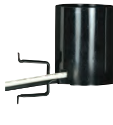
80-1642 Snap-In Double Spring Clip w/ 12" B/W Leads 150°C Ht. 1 1/2" Dia. 1 1/4" Bracket 3/4" From Socket 660W-250V