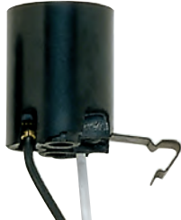
90-595 Snap-In Socket Bracket Extends 1/2" from End of Socket 7" AWM B/W Leads 105°C Ht. 1 1/2" Dia. 1 1/4" 660W-250V