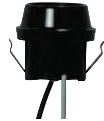
80-1766 Snap-In Double with Flange Rim 13" B/W Leads 105°C Ht. 1 1/2" Dia. 1 5/8" 660W-250V