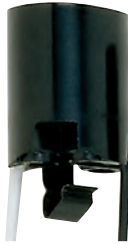
90-540 Snap-In Socket 6" AWM B/W Leads 105°C Ht. 1 1/2" Dia. 1 1/4" Bracket 1/4" Below 660W-250V