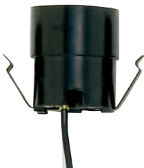
90-541 8" AWM Leads 80-1798 12" AWM Leads Snap-In Socket for 3 1/4"-4" Holders B/W Leads 105°C Ht. 1 1/2" Dia. 1 1/4" 660W-250V