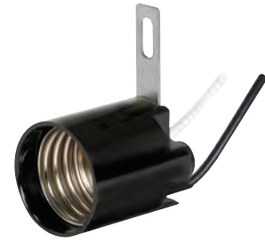
80-2163 Straight Bracket w/Hole Bracket Extends 1" from End of Socket 8" AWM B/W Leads 105°C CSSNP Ht. 1 1/2" Dia. 1 1/4" 660W-250V