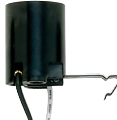
90-543 Snap-In Socket for 6" Pans Bracket Extends 7/8" from End of Socket 8" AWM B/W Leads 105°C Ht. 1 1/2" Dia. 1 1/4" 660W-250V