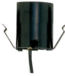
80-1645 Snap-In Socket for 3 1/4"-4" Holders 12" AWM B/W Leads 125°C Ht. 1 1/2" Dia. 1 1/4" 660W-250V