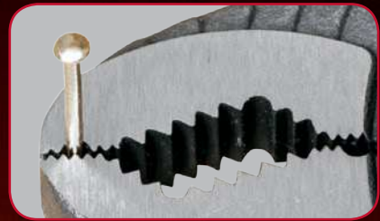
Nail Holding Groove