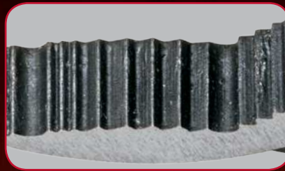
More Gripping Teeth