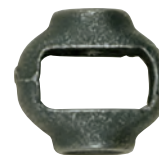
90-1127 1/8 IP x 1/8 IP 90-1128 1/8 IP x 1/4 IP 90-1217 1/8 IP x 3/8 IP 90-1565 1/4 IP x 1/4 IP 90-1129 1/4 IP x 3/8 IP 90-598 3/8 IP x 3/8 IP 90-613 1/2 IP x 1/2 IP