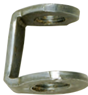
90-114 1/8 IP x 1/4 IP No Hole 90-115 1/8 IP x 1/8 IP No Hole 90-178 1/8 IP x 3/8 IP No Hole 90-1705 1/4 IP x 1/4 IP Tapped Hole 90-175 1/4 IP x 3/8 IP Tapped Hole 90-589 3/8 IP x 3/8 IP No Hole 90-612 1/2 IP x 1/2 IP No Hole