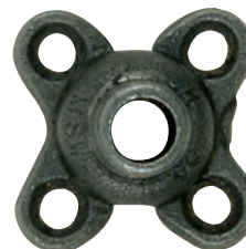
90-1130 3/8 IP Male