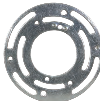
90-1650 4" Round Screw Holes 2 3/4" x 3 1/2" Center to Center 90-1785 with Ground Screw