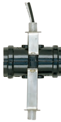
90-465 1 1/2" 1/8 IP Threaded Top Bracket w/ 1/2" Nipple 2 1/8" 1/8 IP Threaded Bottom Bracket w/ 1/2" Nipple 12" AWM B/W Leads 105°C 660W-250V