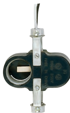
90-414 Twin Offset 1 1/2" 1/8 IP Female Top & Bottom Bracket w/Set Screw 12" AWM B/W Leads 105°C 660W-250V