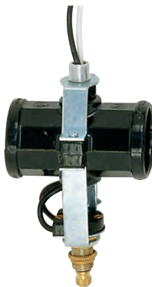
90-416 On-Off Brass Finish Turn Knob 1" 1/8 IP Threaded Top Bracket w/ 1/4" Nipple 1 3/4" 1/8 IP Threaded Bottom Bracket 6" AWM B/W Leads 105°C 660W-250V