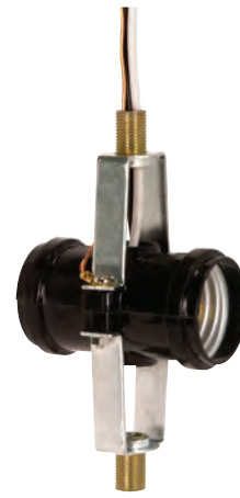
80-1380 1 3/4" 1/8 IP Threaded Top Bracket w/ 1/2" Nipple 1 3/4" 1/8 IP Threaded Bottom Bracket w/ 1/2" Nipple 12" AWM B/W Leads 105°C w/Ground Wire 660W-250V