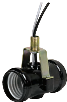
80-2267 1 3/8" x 1/8 IP Threaded Top Bracket w/ 12" AWM B/W Leads 105° 1/2" Nipple 660W-250V