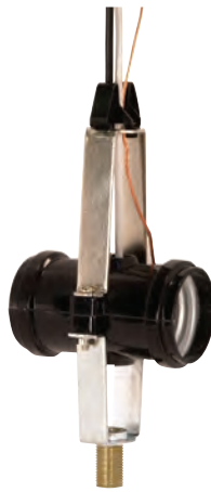
80-1379 Snap-On Top 2 3/8" Bracket + Snap, 1 3/4" 1/8 IP Threaded Bottom Bracket w/ 5/8" Nipple 12" AWM B/W Leads 105°C w/Ground Wire 660W-250V