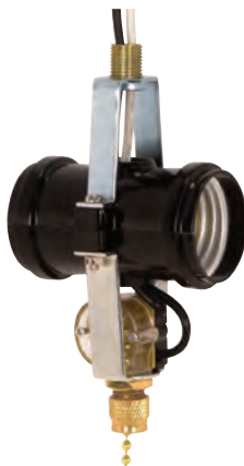
90-415 On-Off Brass Finish Pull Chain 1 1/2" 1/8 IP Threaded Top Bracket w/ 3/8" Nipple 1-3/4" 1/8 IP Threaded Bottom Bracket 12" AWM B/W Leads 105°C 660W-250V