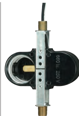
80-1664 Twin Offset 1 1/2" 1/8 IP Threaded Top Bracket w/ 3/8" Nipple 1 1/2" 1/8 IP Threaded Bottom Bracket w/3/8" Nipple 12" AWM B/W Leads 105°C 660W-250V

PLEASE NOTE: Socket Cluster measurements are from the center line to the top & bottom of brackets.