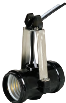
80-2266 Snap-On Top 2 3/8" Top Bracket + Snap Only, w/ 12" AWM Leads 105° 660W-250V