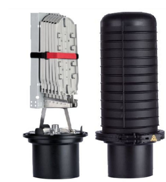
FOSC® 450 BS Fiber Optic Splice Closure, Gel Cable sealing, one pre-installed 24-splice tray, 6 cable attach., valve