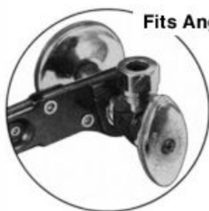
Fits Angle Stop

We have taken the PASCO part numbers 4520 & 4529 and combined them into one tool. The larger forged steel socket "opens" to attach to an angle stop. The smaller forged steel socket "opens" to attach to a 3/8" outlet supply nut.