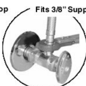
Fits 3/8" Supply Nut

SMALL END ALSO FITS DISHWASHER INLET ELL!