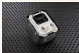
XD-UR200 Universal OEM Iron Core