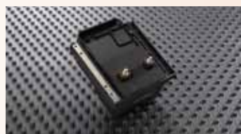
SSI-UR200 Universal Electronic ignitor