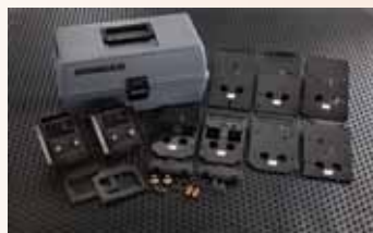
Electronic Replacement Kit

Dongan Universal Replacements are available for every service need - Electronic, Electronic Replacement Kits, OEM-Iron Core, and LJH-90A® & LJH-90C® Multiformer. They are engineered to fit the most common applications with base plates and replacement terminals on most of the popular OEMs. Many competitors base plates may be attached as well.