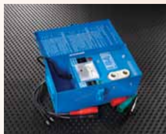
1909-82 Iron Core Transformer Tester