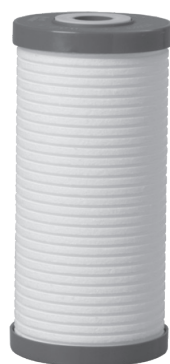
AP810 / AP811