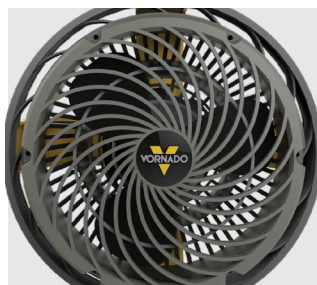
EASY-CLEAN REMOVABLE GRILL