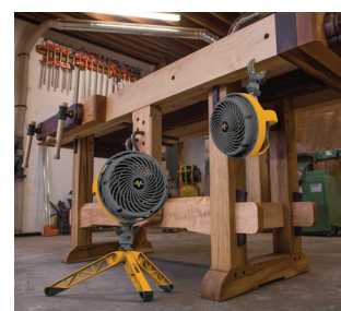
STYLE & FUNCTION