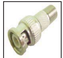
75-517 "F" Female to BNC Male adapter. 75-517G Gold version. 75-679 75 ohm version.