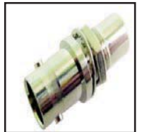
75-521-3/8 Panel feed thru connector. BNC Female to RCA Female. Bushing dia.: .365". Bushing length: .27". Overall length is 1.06". Mounts in .375" hole.