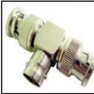
75-622 3-way BNC "T" Connector, with 2 Males to 1 Female.