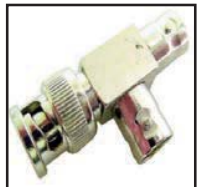
75-623 BNC "T" Connector, with 1 Male to 2 Females.