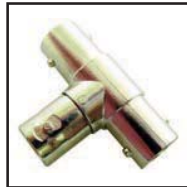
75-541 BNC "T" with 3 Female BNC connectors. 75-691 75 ohm version.