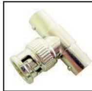
75-540 "T" adapter, 2 BNC Females to 1 BNC Male. 75-690 75 ohm version.