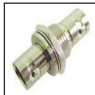
75-628 Isolated BNC feed thru. True 75 ohm. Overall length 1.29". Mounts in .5" D hole. 75-628-50 50 Ohm Version