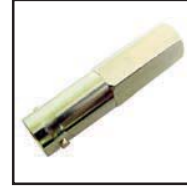
75-566 Inline BNC Female solderless screw on adapter for RG-58.