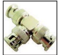
75-621 3-way BNC "T" BNC Male connectors.