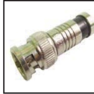
Water Resistant Compression Style Connectors Nickel Version 75-533-PS-BNC RG59 75-534-PS-BNC RG-6 Gold Version 75-533G-PS-BNC RG59 75-534G-PS-BNC RG-6 75-534Q-PS-BNC Quad Shield RG-6 Version