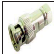
75-527 BNC Male to "F" Male.