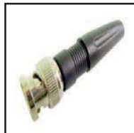
75-559-ST-75 75 ohm version 75-559-ST 50 ohm version Solderless BNC Male connector for use with RG-59 coax cable. Cable opening .24". Black snap style plastic body.