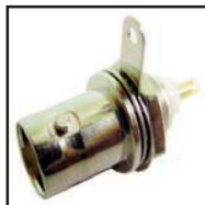
75-543 BNC Female chassis connector. Overall length is 1.08". Mounts in .375" chassis hole. Bushing length .28". 75-543G Gold version. 75-697 75 ohm version.