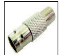
75-526 BNC Female to "F" Female.