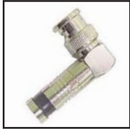
Right Angle Water Resistant Compression Style Connectors Nickel Version 75-533-PSBNCRA RG59 75-534-PS-BNCRA RG-6 Gold Version 75-533G-PSBNCRA RG59 75-534G-PSBNCRA RG-6

Please Note: For 75-533-PS & 75-534-PS Series, images and specifications are subject to change