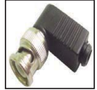
75-559-75 75 ohm version 75-559 50 ohm version Solderless BNC Male right angle connector for use with RG-59 coax cable. Cable opening .24". Black snap style plastic body.