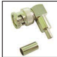
75-554 BNC right angle crimp connector for RG-58. 2 pcs.