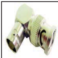
75-561 BNC Male to BNC Female right angle adapter. 75-693 75 ohm version.