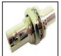
75-521 Panel feed thru connector. BNC Female to RCA Female. Bushing dia.: .487". Bushing length: .33". Overall length is 1.29". Mounts in .5" hole. 75 ohm. 75-521-50 50 Ohm version