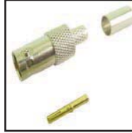
75-645 50 Ohm BNC Female inline connector for RG-59. 3 piece crimp.