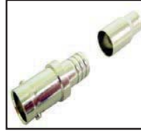
75-646 RG-59 crimp BNC Female 2 piece.