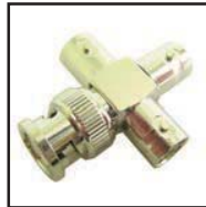
75-620 4-way BNC "T" Connector, with 3 Females to 1 Male.