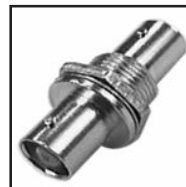
75-552 BNC feed thru double Female panel mount. Mounts in .5" D hole. Overall length is 1.28". Bushing length .33". 75-696 75 ohm version