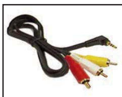
3.5mm 4 conductor plug