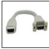
35-707 HDMI Female to HDMI panel mount Female 6 inch length. Hardware not supplied.