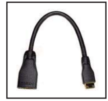
35-728 HDMI Female to Mini HDMI Type C Male adapter cable.