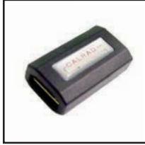
35-713-A HDMI Female to Female inline Coupler with Gold contacts.