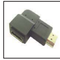
35-709 HDMI M-F Low profile right angle adapter for HDMI. Unique flat on side design. Gold plated.