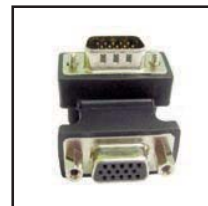
35-704 15 pin VGA Male to Female right angle adapter for projectors. Cable exits up from the jack.