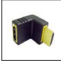
35-714 HDMI Female to Male right angle adapter. Up 90 degrees Gold contacts.