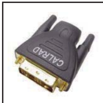
35-711A HDMI Female to DVI-D Male adapter with Gold plated contacts.