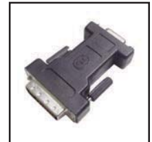
35-701 DVI-A Male to VGA DB-15 Female Adapter. This adapter allows you to connect a DVI-A display to a VGA graphics card.