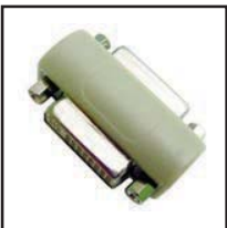
35-710A DVI-I to DVI-I Female to Female Coupler. Shielded di-cast case handles 5 pin analog and 24 pin digital signals. gold plated contact pins. Used for inline or chassis mount. Overall length .93" For wall mounting use Calrad p/n 30-598.