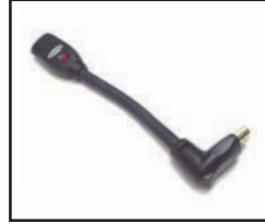
35-718,35-718A HDMI Right Angle Adapter Cables The 35-718 Series Adapters provide a low profile cable exit solution for tight spaces Behind video displays, A/V receivers, switching and amplifier devices. Length 6".