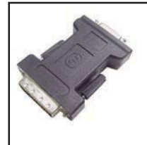
35-702 DVI-D Female to DFP 20 Pin Male adapter. 35-703 DVI-D Male to DFP 20 Pin Female adapter.