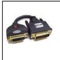
35-717 DVI-I Female to M1DA Male plug. Length 6" Gold plated contacts.