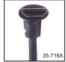
35-718 Cable exit to top 35-718A Cable exit to bottom.