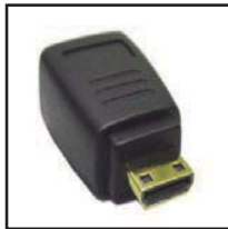
35-706 HDMI Female to mini HDMI Male adapter. Gold plated contacts.