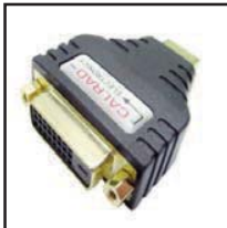
35-712A HDMI Male to DVI-D Female adapter with Gold plated contacts.