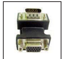
35-704A 15 pin VGA Male to Female right angle adapter for projectors. Cable exits down from the jack.