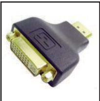
35-727 DVI-D Female to Male Display Port Male adapter.