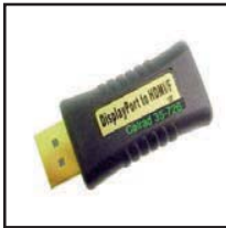
35-726 HDMI Male to Display Port Female adapter.