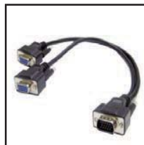
35-600 DB 15 VGA "Y" cable. 1 Male to 2 Females. 1 ft length. Gold plated.