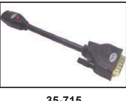
35-715 HDMI Female to DVI-D Male Cable Adapter. Gold plated contacts. 6" Length 35-716 HDMI Male to DVI-D Female cable adapter. Gold plated contacts. 6" Length.