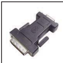
35-700 DVI-I Male to VGA DB-15 Female Adapter Allows you to connect VGA display to a DVI-I graphics card. Note, this adapter does not provide a digital to analog signal conversion. It will not work with DVI-D.