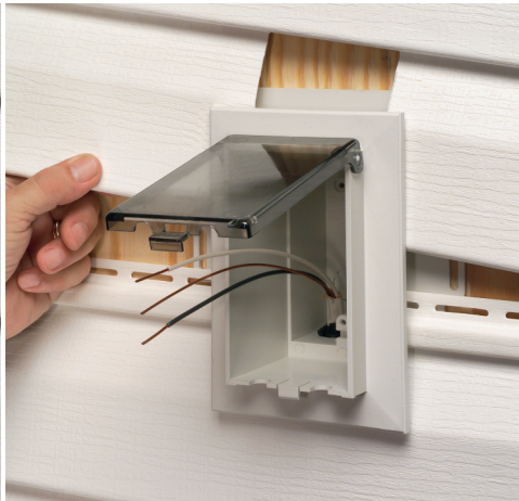
for New & Existing Vinyl Siding