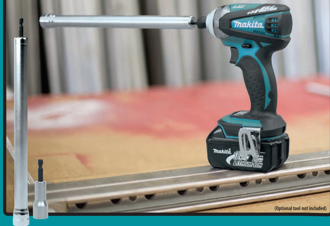
(Optional tool not included)