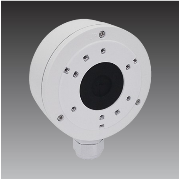
Junction Box (for A310, A311, A314)