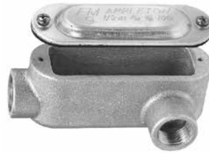
Type LL with Form-IN-Place cover