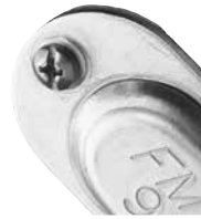
Captive Stainless Steel Pan-Head Cover Screws