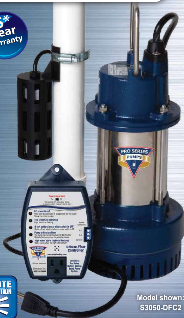
Model shown: S3050-DFC2