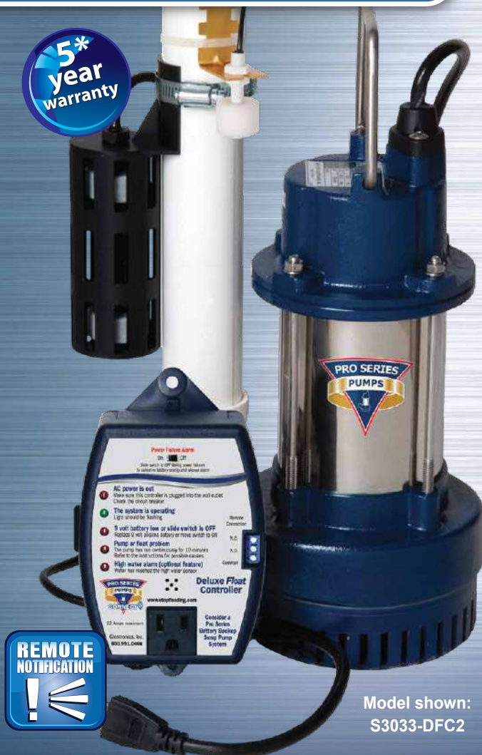
Model shown: S3033-DFC2