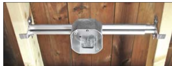
54171-FANBH IN USE