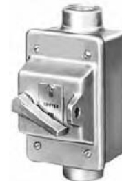
Waterproof Type 3, 4 & 5