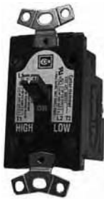
Modular Toggle Operated Starter