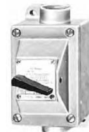
Hazardous Location Type 7D, 9E, 9F & 9G