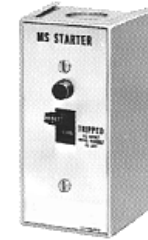
Switch and Pilot Light Mounted in Type 1 Enclosure