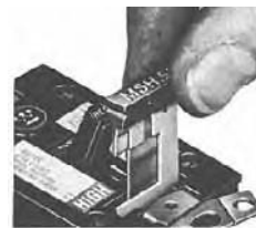
Heater Element Installation