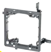
2-gang w/ four mounting wings LV2HD