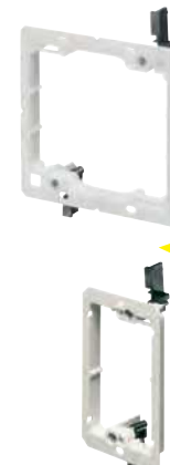
Two-gang low profile LV2LP