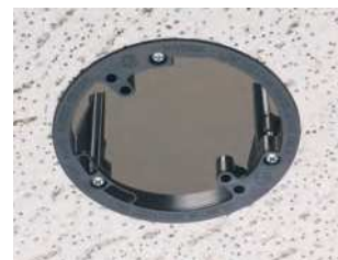
Vertical or Horizontal Mounting