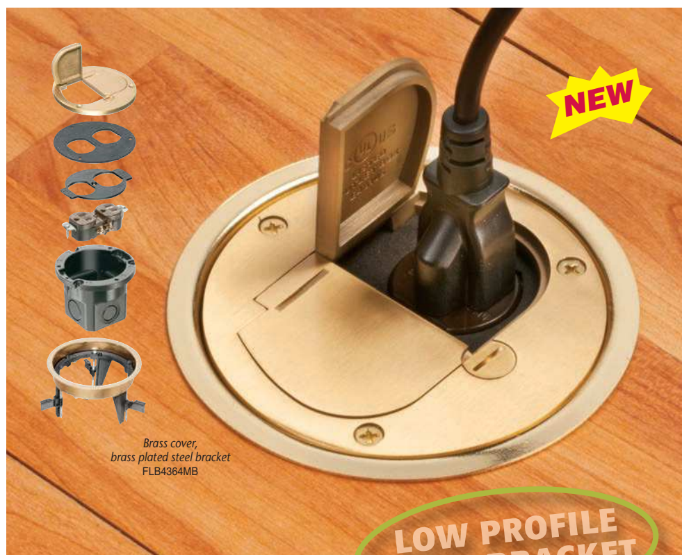
Brass cover, brass plated steel bracket FLB4364MB

Fastest, FLUSH installation • Low Profile Metal Covers, Steel Bracket