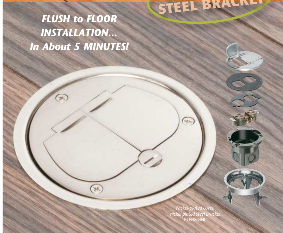
Nickel-plated cover, nickel plated steel bracket FLB4364NL

FLUSH to FLOOR INSTALLATION... In About 5 MINUTES!