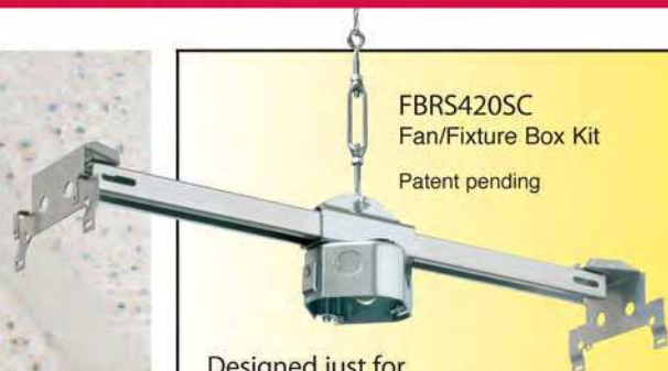
FBR5420SC Fan/Fixture Box Kit Patent pending

Designed just for mounting a fan or fixture on a suspended ceiling grid, Arlington's FBR5420SC fan/fixture box kit saves money, and 30 minutes of installation time!