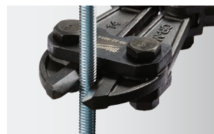
Forged Steel Blades & Custom Heat Treated Maximum durability