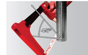
45° Angle Blade Position