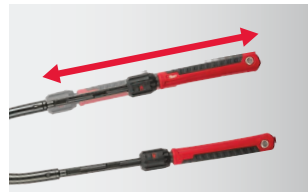
POWERMOVE™ Extendable Arms