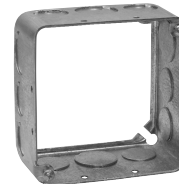
TP443 (2 1/8" Deep)