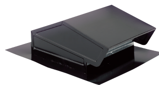
Roof & Wall Caps