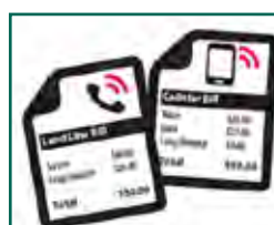
service plans no long distance fees