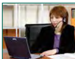
turnkey easy programming from your computer with supplied DKS software