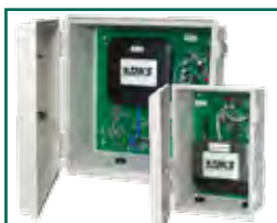
voice & data and voice only models