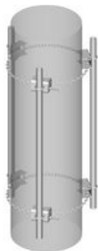
CM-60T-B Chain Mount Base Kit, 16 ft chain