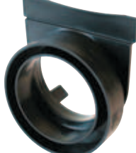
End Outlet FSD-EO

End Outlet accommodates 3" & 4" sewer and drain pipe OR 3" & 4" Sch. 40 fitting hub