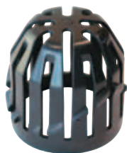
Leaf Guard FSD-LG

Leaf Guard prevents debris from going down drain pipe