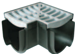
90° Corner FSD-90CGG

90° Corner allows left or right hand extension of the Storm Drain