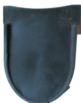
End Cap FSD-EC

90° Corner allows left or right hand extension of the Storm Drain