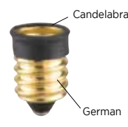
*22402 Socket Adapter Reducer Reduces German or Italian Base to Candelabra Size With Rubber Ring 75 Watts Max., 120 Volts