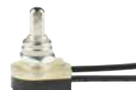
*22306 Push Canopy Switch 4 3/4" Wire Leads 18 Gauge, 105° Leads Fits 3/8" Hole 3A, 250 VAC 6A, 125 VL 6A, 125 VAC Height - 1 1/4"