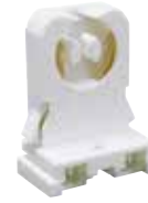
*22453 Medium BiPin Lamp Holder Low Profile Size 660 Watts Max., 600 Volts T8/T12 Non Shunted