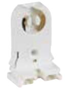
*22456 Medium BiPin Turn Type Lamp Holder Standard Size No. 18/20 Gauge Panel Mount 660 Watts Max., 600 Volts Non Shunted