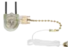
70290 Replacement Canopy Light Switch with Brass Finish Pull Chain 3' Braided Cord 6" Wire Leads Height - 1 1/4" Fits 3/8" Hole