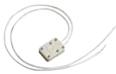
*22471 - GX5.3 Base Mini BiPin Quartz MR16 Socket 12" 18 Gauge Leads SF-1 200° C Leads 100 Watts Max., 250 Volts Height - 1"