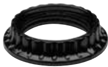
70435 Phenolic Shade Ring for Medium Base Sockets Outside Diameter - 2 3/16" Inside Diameter - 1 5/16" For use with phenolic sockets only.