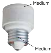
*22150 Porcelain Socket Extender Medium Base 660 Watts Max., 250 Volts Extension - 1/4" Overall Length - 2 1/4"