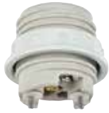
70010 Porcelain Threaded Socket with Aluminum Shade Ring Medium Base Height - 1 1/8" Ring Height - 1/2" 660 Watts Max. 250 Volts