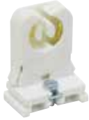
*22454 Medium BiPin Turn Type Lamp Holder Low Profile Size No. 18/20 Gauge Panel Mount, Captive Mount and Screw 660 Watts Max., 600 Volts Non Shunted