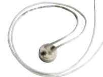
*22470 - GY6.35 Base Mini BiPin Quartz MR16 Socket 12" 18 Gauge Leads SF-1 200° C Leads 100 Watts Max., 250 Volts Height - 3/8"