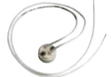
*22472 - GX5.3 Base Mini BiPin Quartz MR16 Socket 12" 18 Gauge Leads SF-1 200° C Leads 100 Watts Max., 250 Volts Height - 3/8"