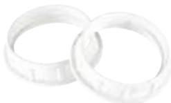
70001 2 Aluminum Shade Rings for Medium Base Sockets Outside Diameter - 2" Inside Diameter - 1 1/2" For use with porcelain threaded sockets.