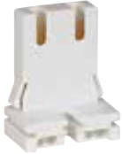
*22457 Medium BiPin Lamp Holder Floating Action for U-Shape Lamps Low Profile Size 20 Gauge 660 Watts Max., 600 Volts Non Shunted