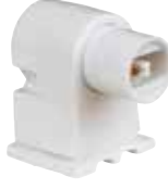
*22491 Plunger End Lamp Holder For HO, VHO, SHO Lamps 660 Watts Max., 1000 Volts Non Shunted