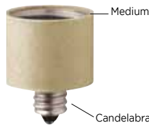
*22411 70361 Socket Adapter Enlarger Enlarges Candelabra Base to Medium Base 75 Watts Max., 125 Volts