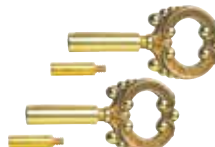
70160 2 Socket Keys Brass Finish With 1/2" Extensions Tapped 3/16"-F x 3/16"-M